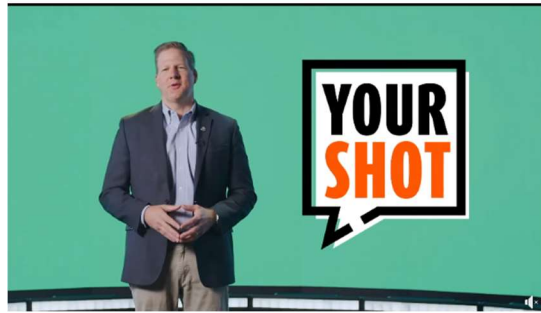
Your Shot The COVID-19 vaccine is our shot to get back to normal, and now anyone 16 and older f... See More

LIST OF WALK-IN VACCINATION OPTIONS – For more information on daily walk-in vaccinations at NH State sites and local pharmacy same-day sites, click here. https://tinyurl.com/cb7s2kx5