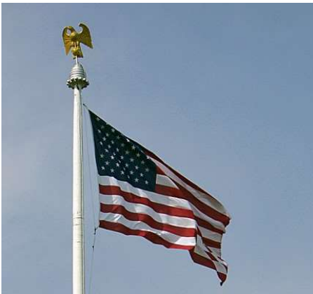
With a refurbished eagle atop the Liberty Pole.

TONIGHT! SPECIAL CITY COUNCIL WORK SESSION ON CITY'S USE OF AMERICAN RESCUE PLAN FUNDS at 7 pm. This meeting is being held in person AND via Zoom -- Attend in person in the Council Chambers at City Hall. Or to register in advance to participate by Zoom, click here. https://tinyurl.com/tnftnu9d