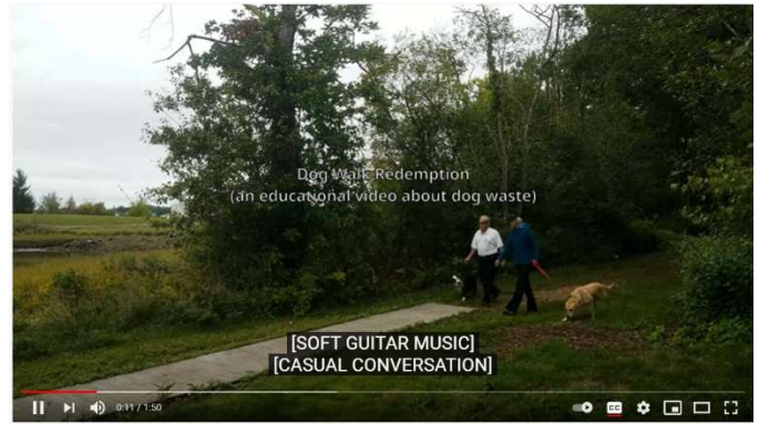
Stormwater Outreach Video - Dog Walk Redemption

For FAQs and additional information click here .