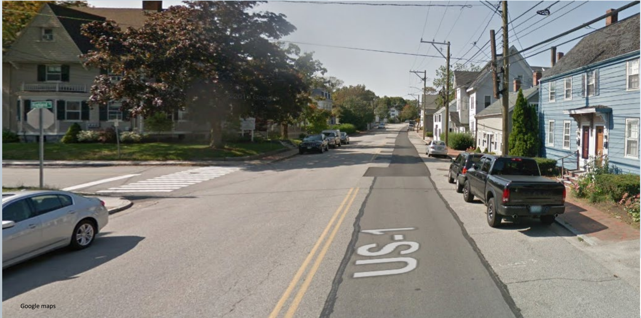
Middle Street at Highland Street