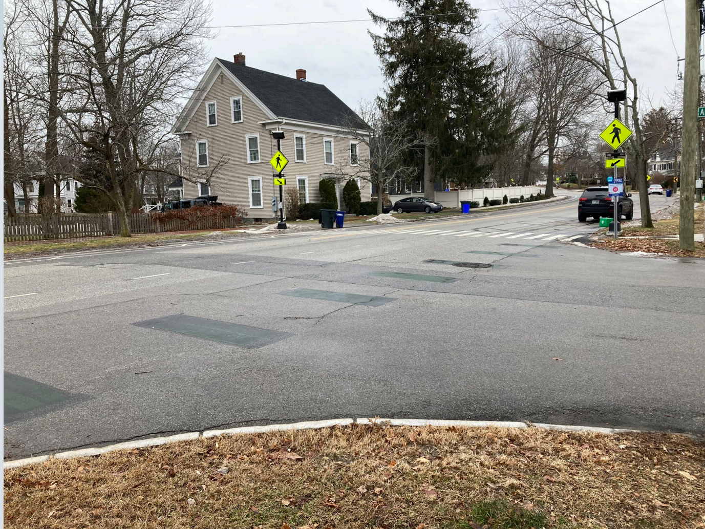
Middle Street at Aldrich Road