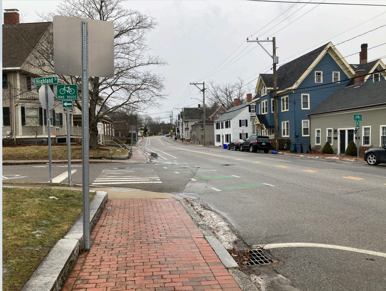
Middle Street at Highland Street