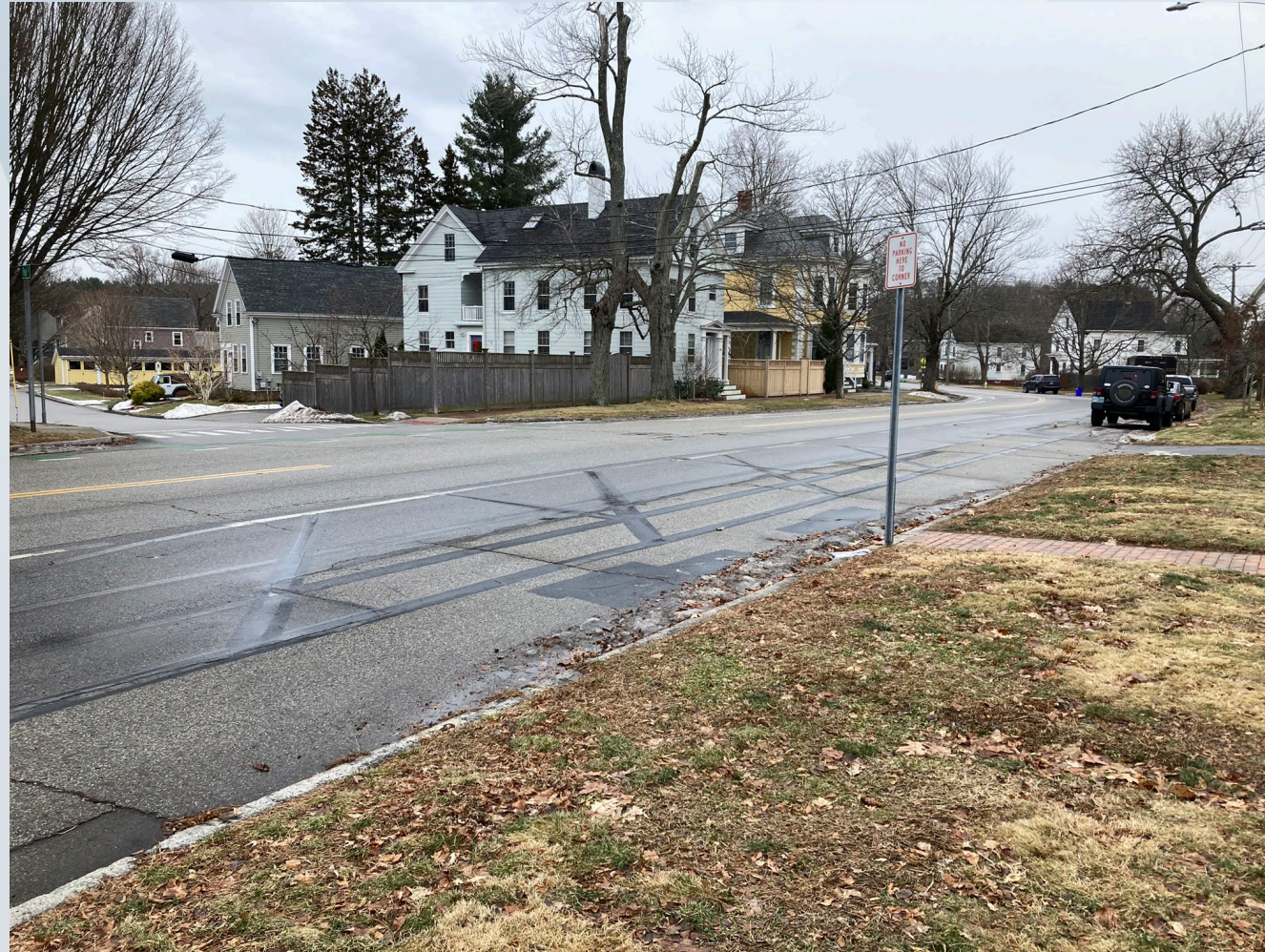
Middle Street at Cass Street