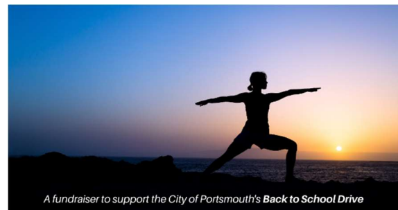
A fundraiser to support the City of Portsmouth's Back to School Drive

VACATIONING? KNOW BEFORE YOU GO WITH CDC TOOL FOR ASSESSING COMMUNITY RISK (ROCKINGHAM COUNTY LISTED AS "LOW") -- CDC recommends using its online tool -- COVID-19 Community Levels based on hospital beds being used, hospital admissions, and the total number of new COVID-19 cases in an area. Map as of June 22, 2022.