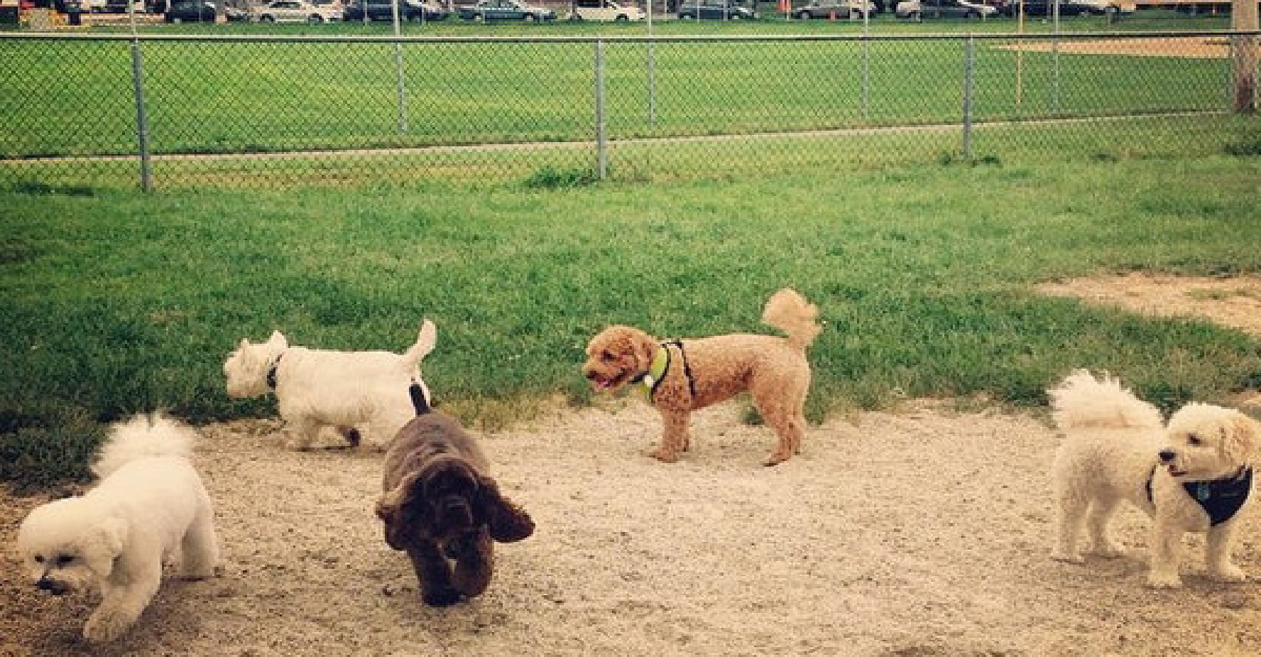
Image: South Mill Pond Dog Park